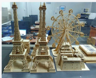
木制品切割 Wood Product Cutting