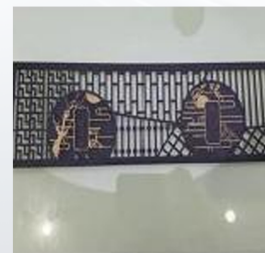
纸板雕刻 Pattern Cutting